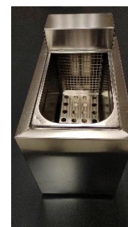
WATER MIXER VERSION Cod. 8826001